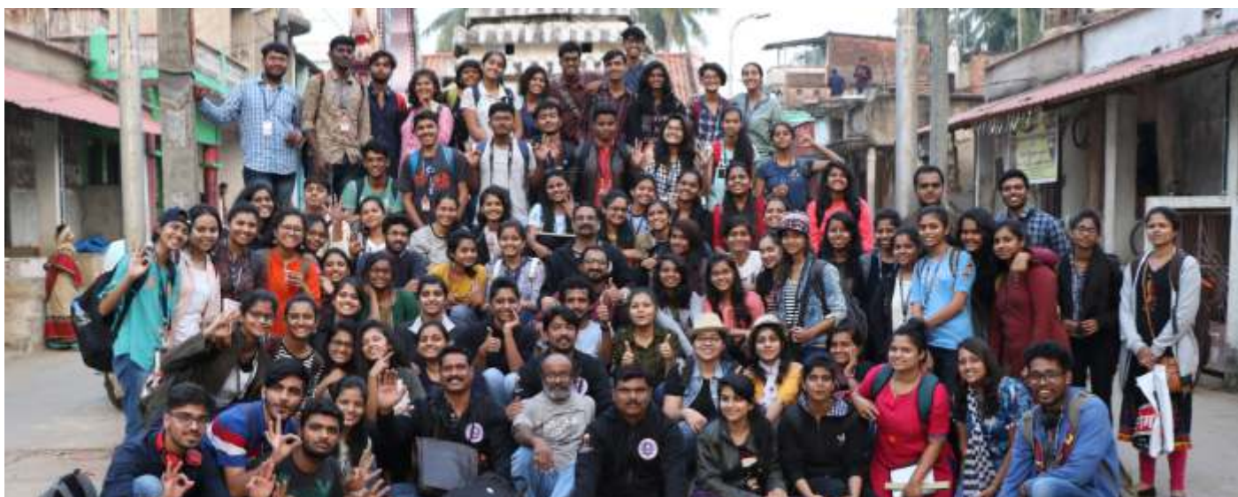
IDS Tour 2017-18 to Odisha to study 'Pattachitra' in Raghurajpur