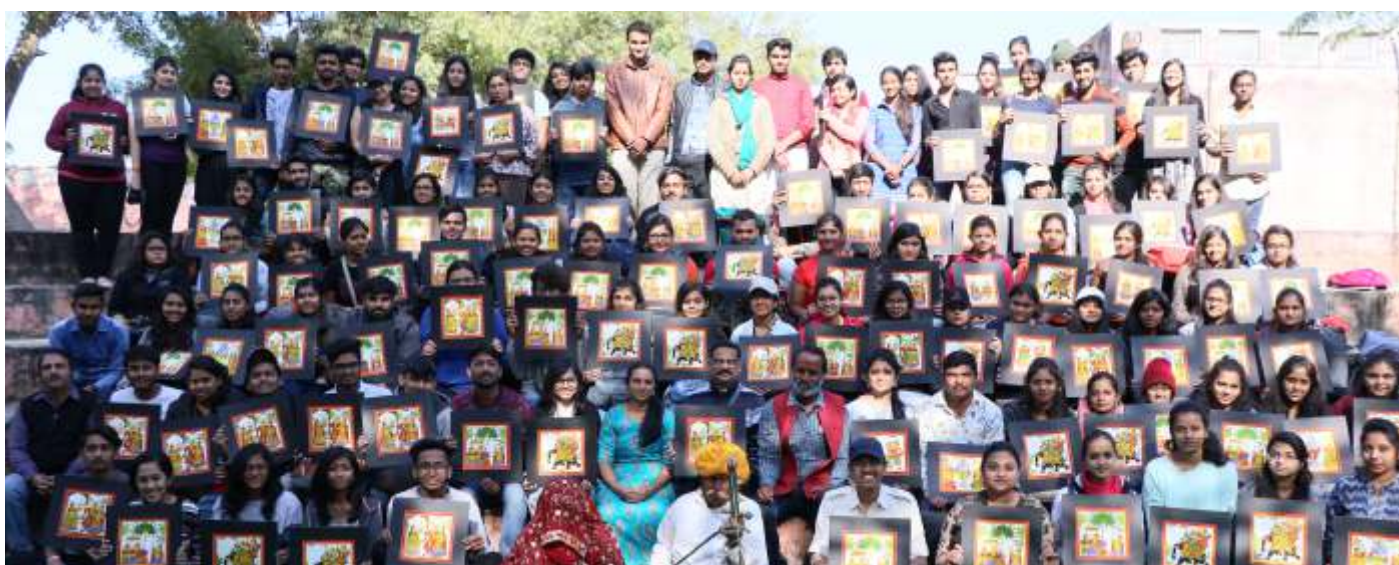
IDS Tour 2018-19 to Chittorgarh(Bhilwara, Rajasthan) to study 'Phad Painting'