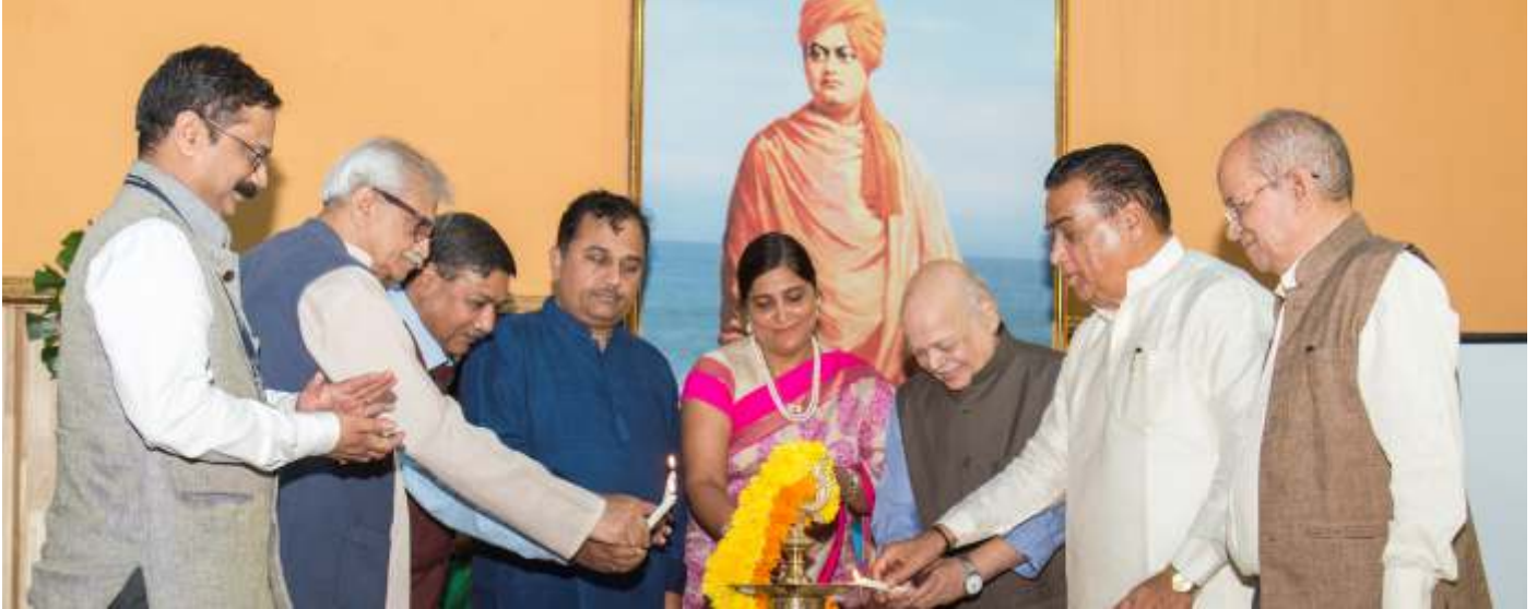
Inaugural Ceremony of MITSoFA, "Kaleidoscope 2017", a Unique Amalgamation and Foundation day for Music and Arts