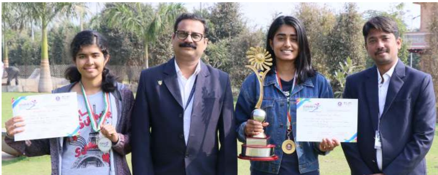
MIT SOFA Winners at Vishwanath Sports Meet, the annual sports event of MIT ADT Univeristy