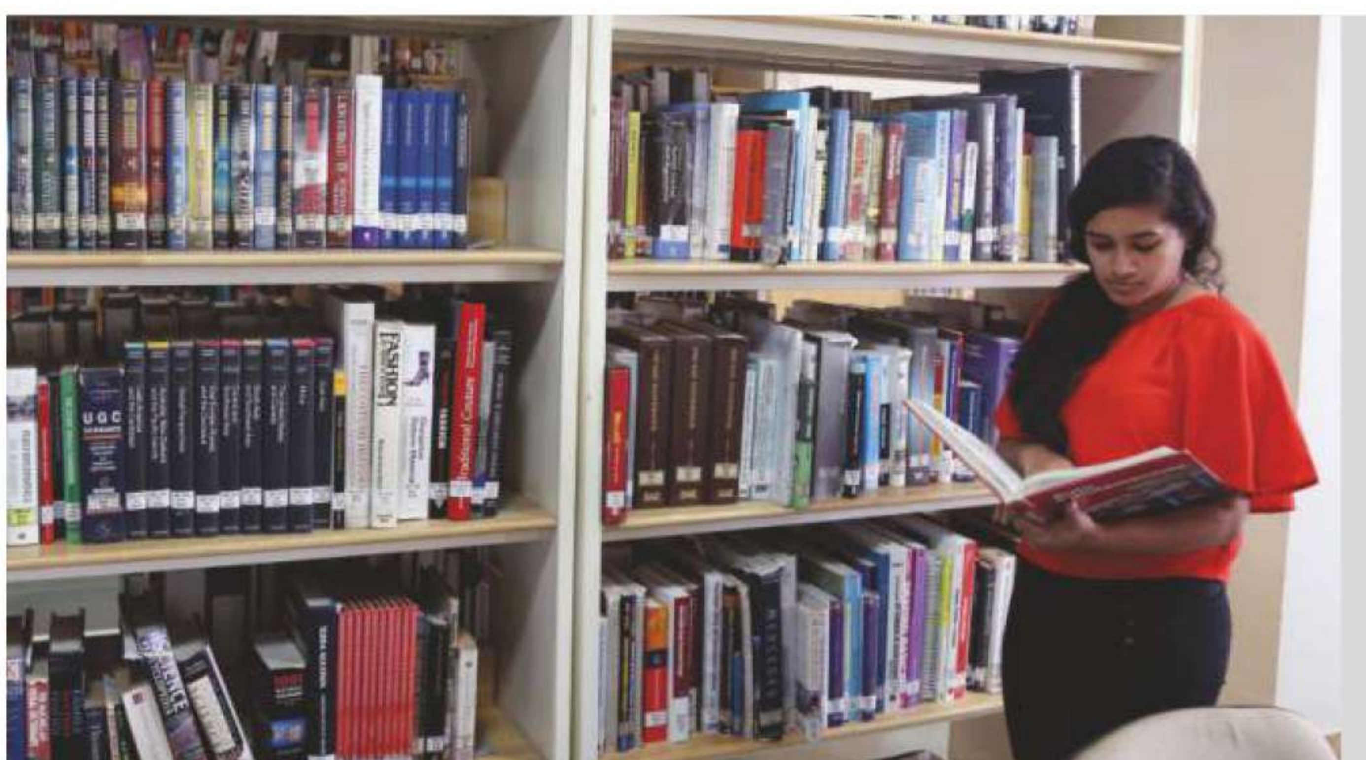
State of Art Library