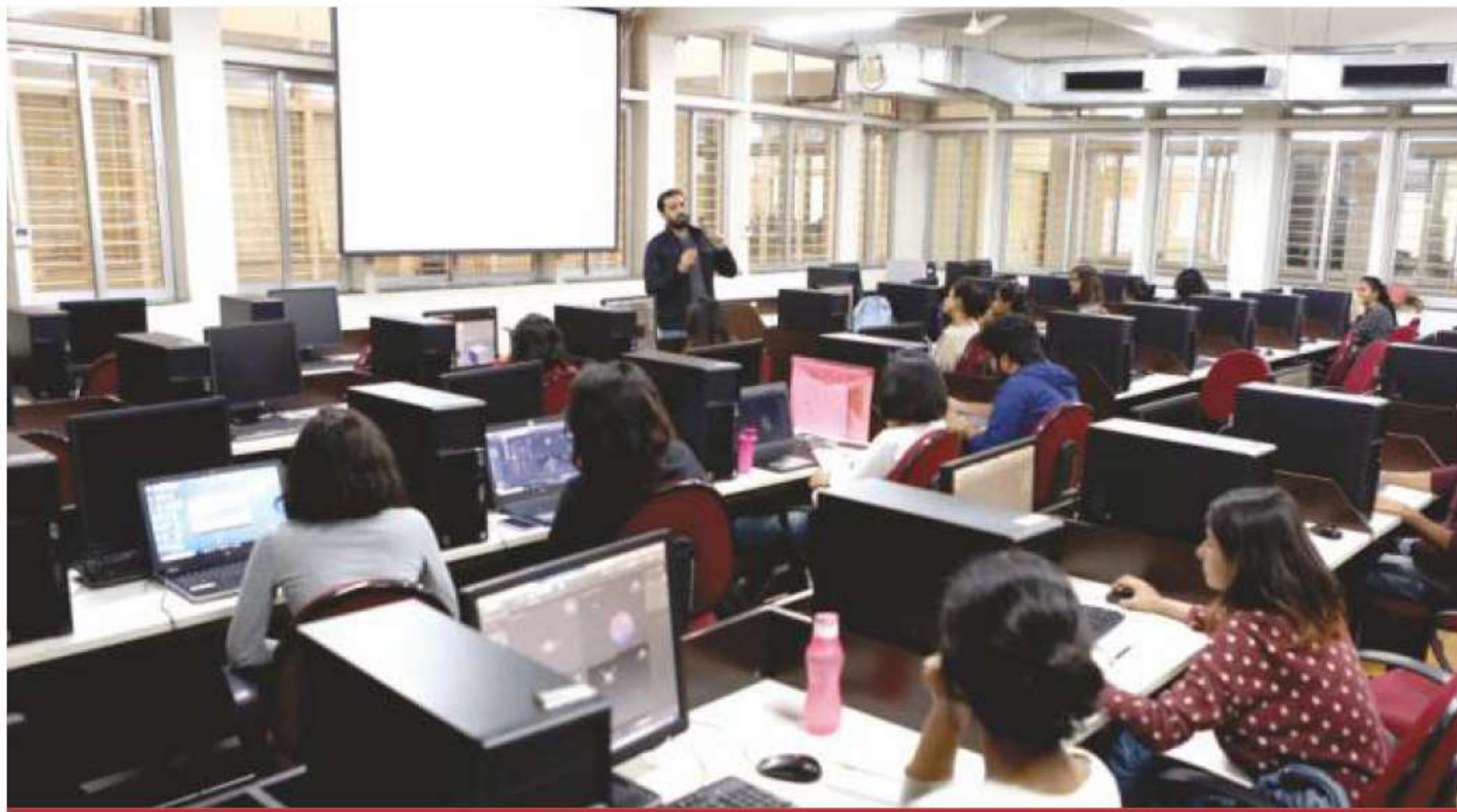
Well Equipped Computer Lab