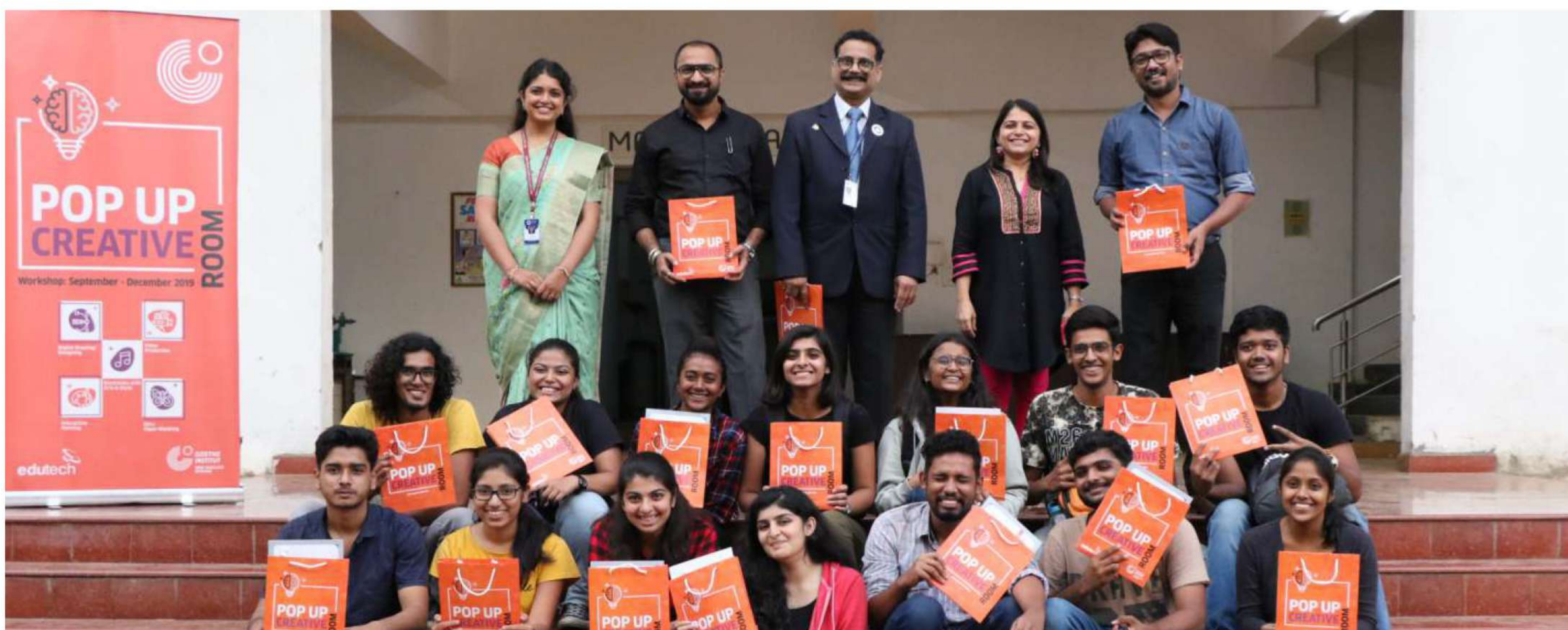
Workshop on 2D & 3D Animation & 3D Printing for Applied Arts students, organised by Max Muller