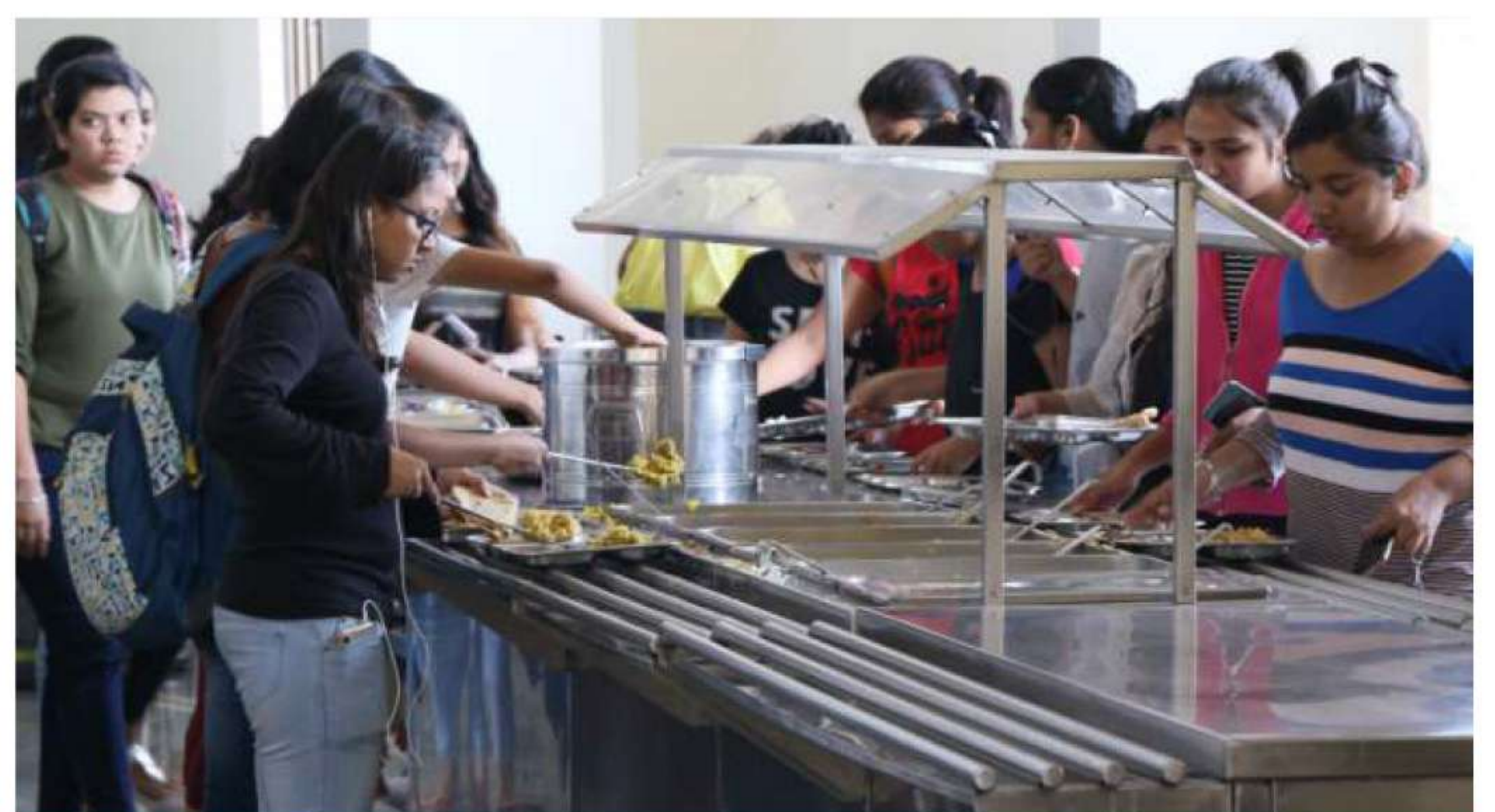
Canteen / Mess