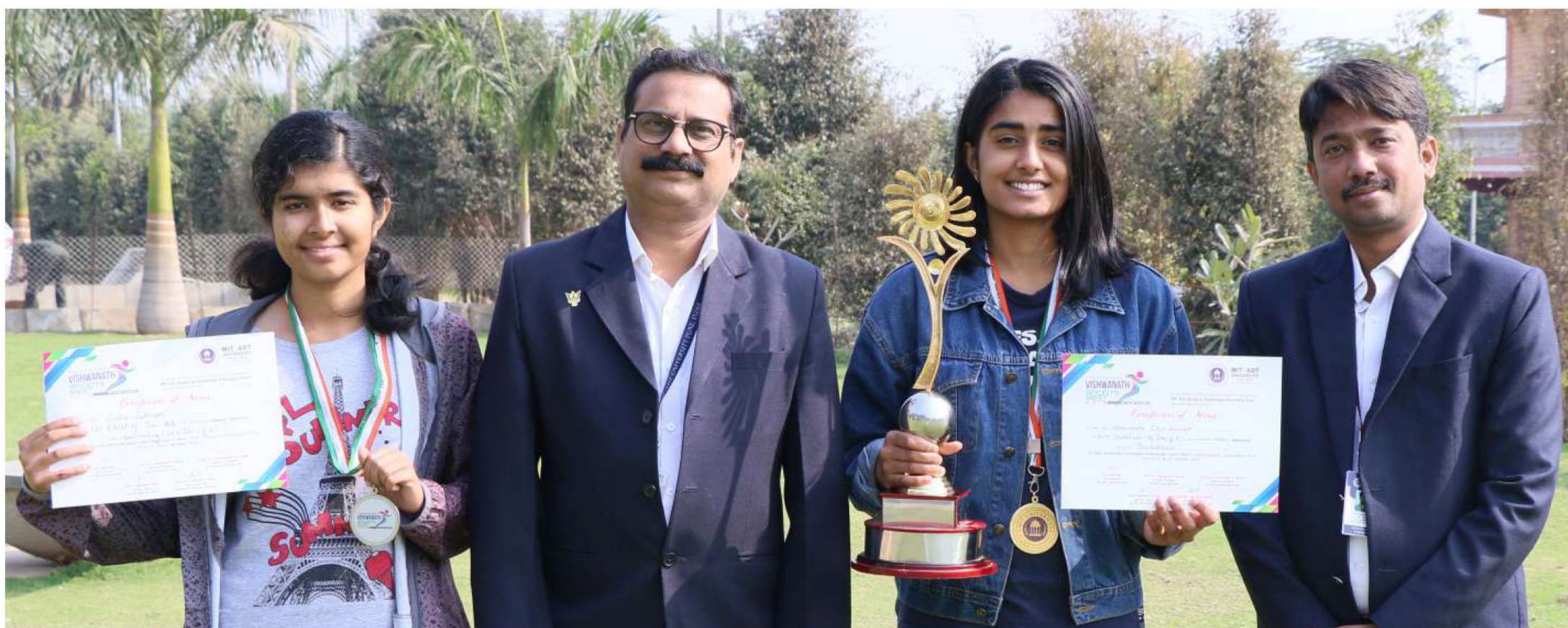
MIT SOFA Winners at Vishwanath Sports Meet, the annual sports event of MIT ADT Univeristy