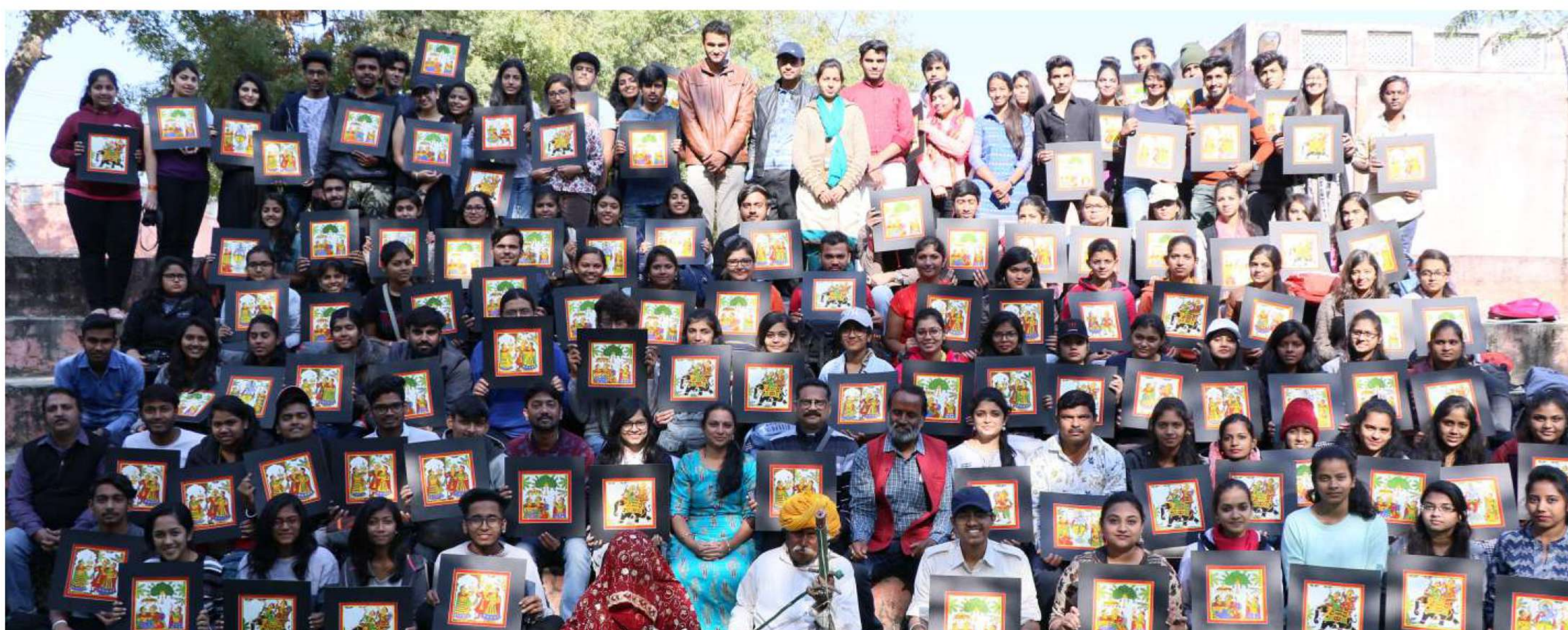
IDS Tour 2018-19 to Chittorgarh(Bhilwara, Rajasthan) to study 'Phad Painting'